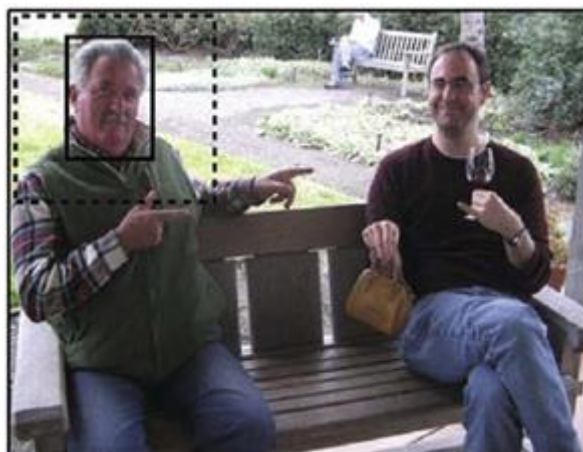
Figure 2 Global-context and local-context

These methods are global-context and local-context (Figure 2). Global-context concerns with the information taken from the entire image including the object, while local-context concerns with the details at the object neighborhood's areas (Galleguillos and Belongie, 2010; George, 2016). Psychology studies related object recognition are used to learn these essentials (Galleguillos and Belongie, 2010). In (figure 2), straight window shows global-context , while dotted window shows local-context .